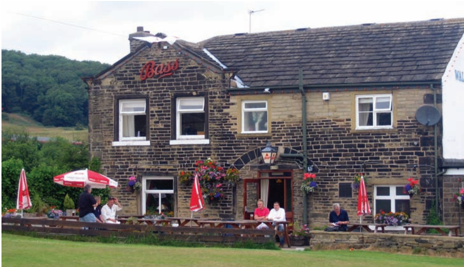
The Walkers Arms at Leymoor

Alongside a cricket ground there was a golf course, bowling green and set of tennis courts. And it was the Earl of Dartmouth, landlord and patron, who assisted Slaithwaite in their switch to Hill Top in 1881. It is said that, out of pure goodwill, he demanded only a nominal rent from the infant cricket club.