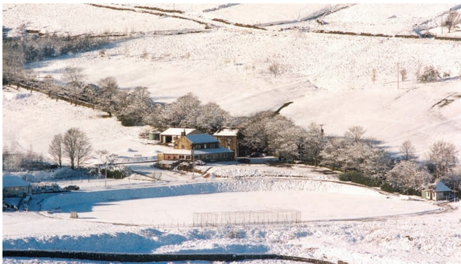
Hemphow, Marsden Cricket Ground in Winter

A cuckoo is emblazoned on the Marsden club cap and all official literature emanating from Slaithwaite CC features a 'moon-and-star' logo - demonstrating that both organisations feel a strong civic affiliation. Likewise, the 'Golcar lily' is much in evidence at Swallow Lane, and over the years loyal supporters have yelled 'Come on the Lilies!' from the boundary edge. And as if to emphasise the centrality of the club to the local community, in 1905 the annual Golcar Sing was staged on the hallowed turf of the cricket ground.