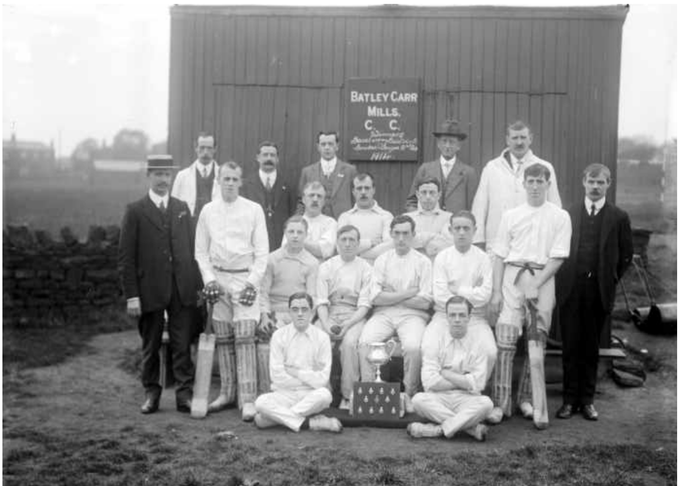
Dewsbury & District Division 2 Winners 1914