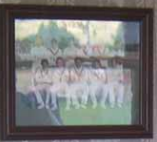
A group of players, 1910-1915

The club members were asked to bring on the silverware. The following is a list of the items that were brought in.